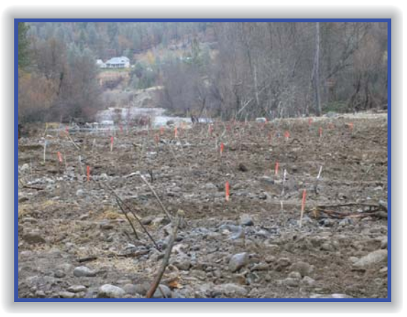
Thousands of stakes mark plantings.

To encourage rooting, cuttings were first kept in water, then cold storage, followed by a final soak just before planting. A total of 7,122 willow and cottonwood cuttings were planted at the Sawmill site between November and January. More than 7,500 herbaceous riparian plants such as mugwort (Artemesia douglasiana), baltic rush (Juncus balticus), common rush (Juncus