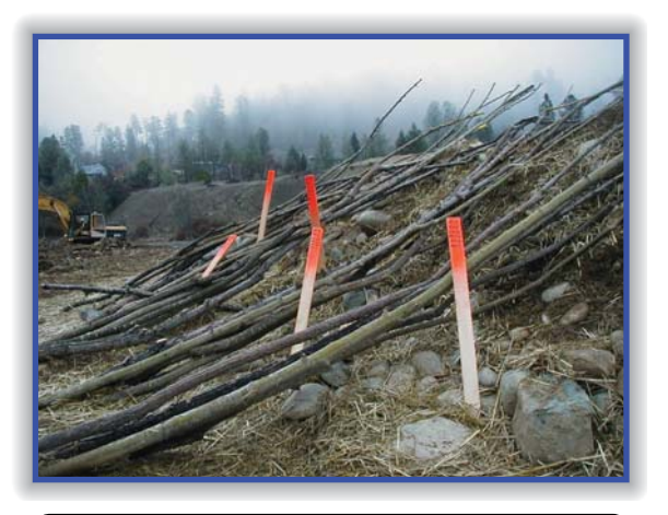
Cuttings ready for mechanical cluster planting to ensure they reach the water table.