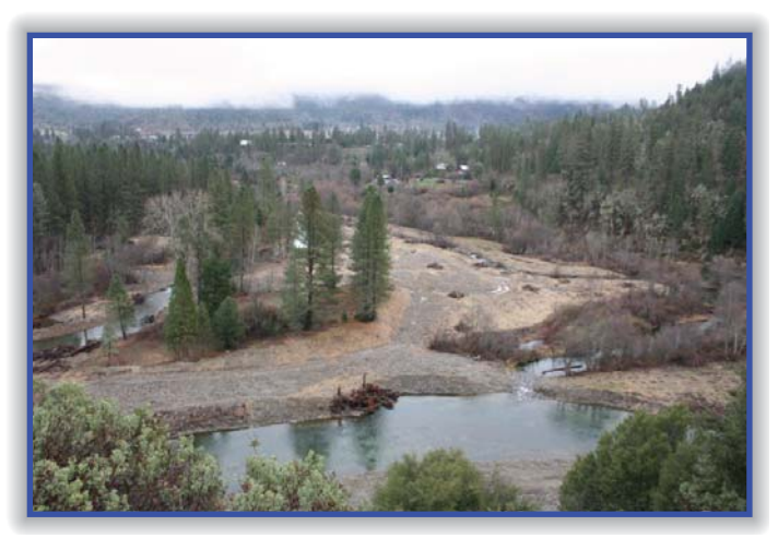
Portion of Sawmill site viewed from Goose Ranch Road.

The Trinity River Restoration Program (TRRP) has applied scientific knowledge to recreate properly functioning conditions along the river, conditions that were impaired by low flows following the construction of the dam. TRRP plans and conducts mechanical channel rehabilitation and sediment management activities at several locations, including work to create additional fish and wildlife habitat.