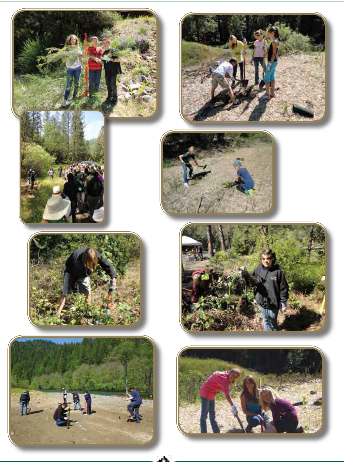
Trinity County Resource Conservation District